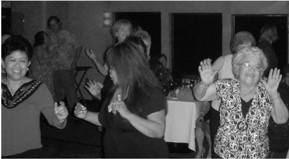
Dancing the night away